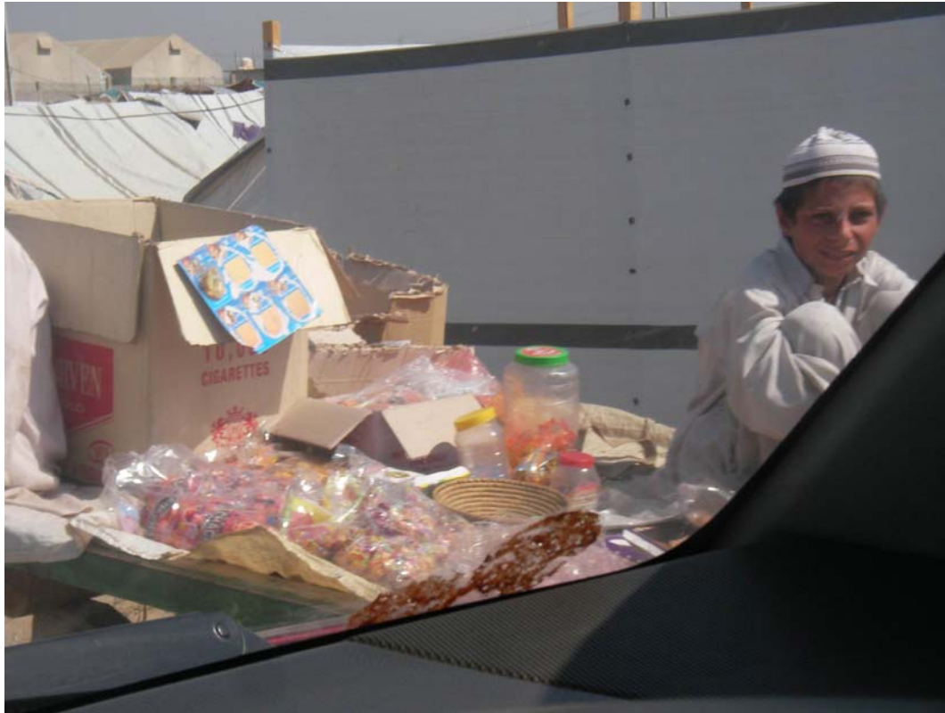
The Child Vendor .. A Child Risk or Child At Work. At Shah Mansoor Camp I